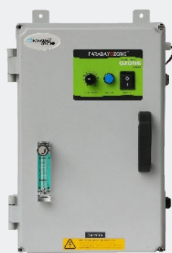
L10G & L20G