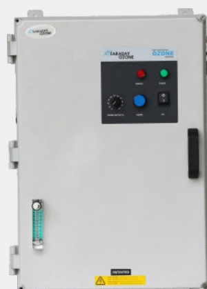
L40G to L60G