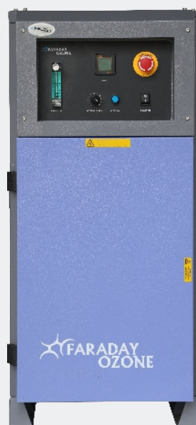
L100G to L300G