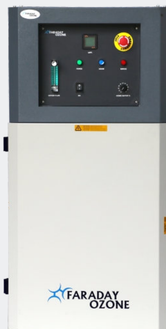
M100G & M200G