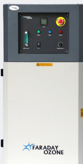
M10G to M50G